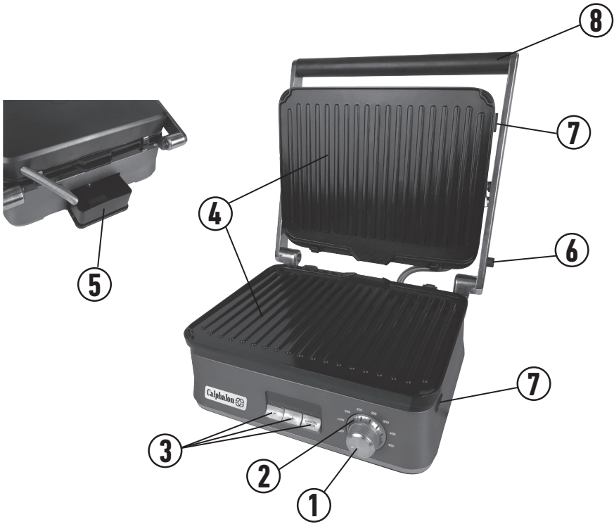
Removable Grill Plates

*These parts can be replaced on Calphalon.com or at 1-800 809-7267